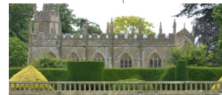
St Mary's Church in the grounds of Sudeley Castle

Here turn right across the field and go through a conifer plantation with two kissing-gates. Carry on straight ahead towards some farm buildings. Go through a wide gate on the left and take the farm track and lane, passing a reservoir on your left. Where the farm track turns right go through a gate on your left 5 and continue